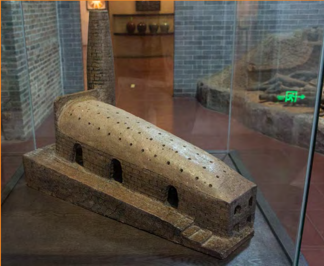
Simplistic model of a typical dragon kiln

The Nanfeng kiln is set at a considerably steeper angle and is longer than this model portrays